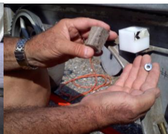
Blade wipe and oil reservoir.