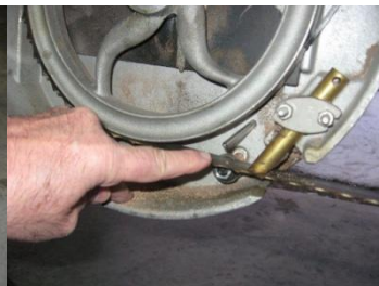
Where drip output is positioned